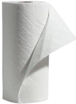
Baby Wipes 3