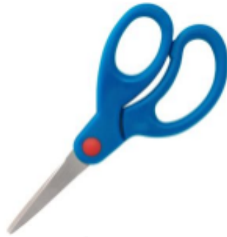
Sticky notes 1 pack of 3